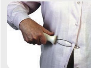
Button Hook Kings

Wooden stick with rubber tip at one end & double wire hook at the other, used to pull on or push off garments that cannot be reached easily.