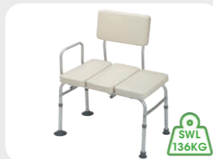
Bath Transfer Bench