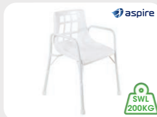
Aspire SHOWER chair