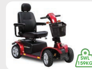
Pride Pathrider 130XL Pursuit

A unique, biometrically shaped handle designed to evenly spread pressure across the palm of the hand. Very useful for arthritics or those with poor grip and is height adjustable.