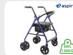
Aspire PUSH DOWN Walker