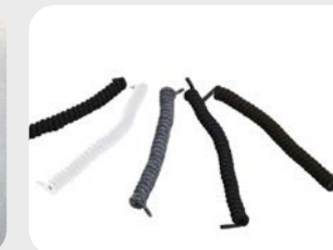
Spring Laces 600 mm

Shaped stainless steel wire for one-handed dressing, passing through the button hole and over the button to grip the thread. Button pulled through with twisting motion.