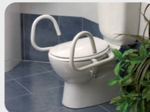
Throne Grab Rail