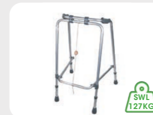
Aluminium Walking Frame Folding