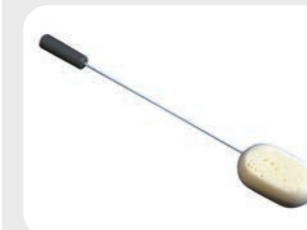
Long Handled Sponge