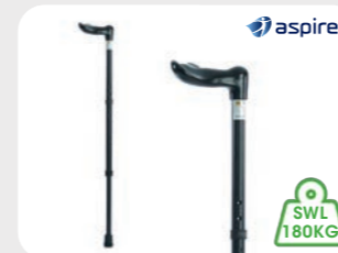
Walking Stick Palm Grip

A unique, biometrically shaped handle designed to evenly spread pressure across the palm of the hand. Very useful for arthritics or those with poor grip and is height adjustable.