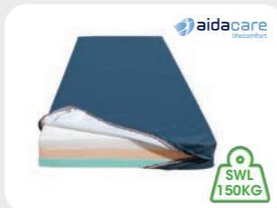
Aidacare Lifecomfort DELUXE Mattress

Features a high quality 3 layer support design with full size memory foam overlay, 2 way waterproof stretch cover, vinyl bottom cover and 3 sided zip.