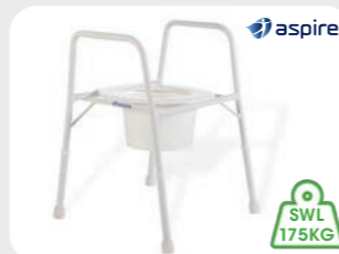
Aspire OVER TOILET Aid