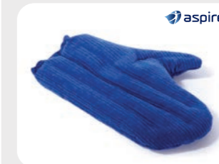
Lupin Hot/Cold Pack Hand Glove

Used in place of normal laces to make putting on shoes easier. They turn lace-up shoes into slip-ons. Fasten by wrapping the ends together.