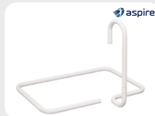
Aspire Bed Pole Grip Handle

Features a high quality 3 layer support design with full size memory foam overlay, 2 way waterproof stretch cover, vinyl bottom cover and 3 sided zip.