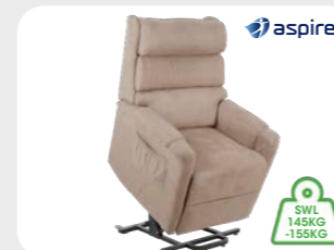
Aspire SIGNATURE Chair