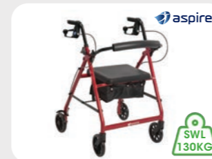
Aspire CLASSIC Walker