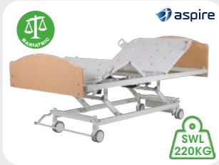
Aspire AC3 KING SINGLE Bed