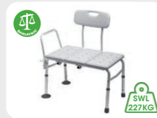
Bath Transfer Bench Bariatric