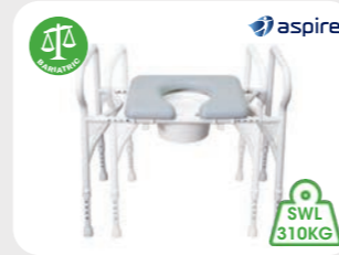
Aspire MAXI Over Toilet Aid