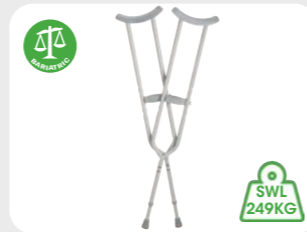
Underarm Crutches Bariatric Adult