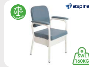
Aspire DELUXE Bedside Commode