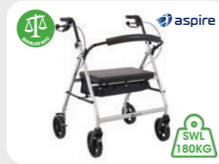
Aspire XL HEAVY DUTY Walker