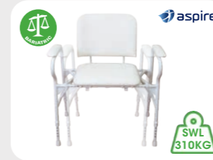
Aspire MAXI Shower Chair