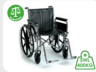
Super Heavy Duty Wheelchair