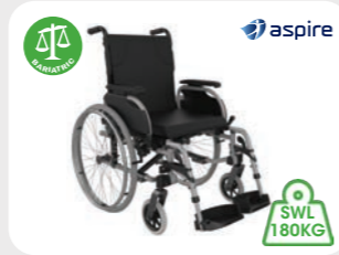
Aspire Evoke 2 HD Wheelchair