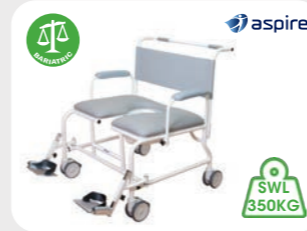
Aspire Bariatric Shower Commode