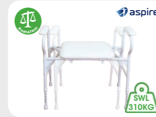
Aspire MAXI Shower Stool