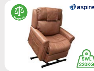
Aspire Montana MAXI Lift Recline Chair