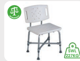
Shower Stool Maxi Compact