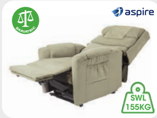
Aspire SIGNATURE Chair