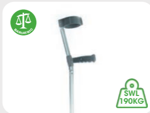
Forearm Crutches Custom