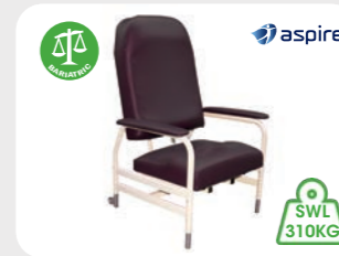
Aspire MAXI Day Chair