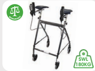
Gutter Frame Walker – HD with brakes