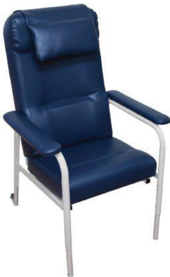
CHP208030 - Aspire Adjustable Day Chair – Ink Vinyl