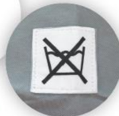
Intuitive usage indicator identifies when sling has been wet or washed, rendering it no longer available for use.