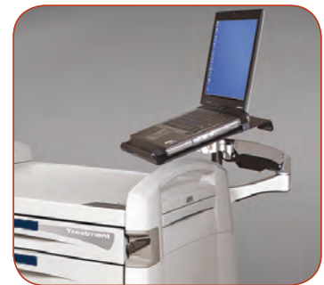
Laptop Tray, Articulating Arm & Mount