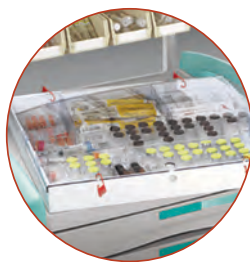
Removable Drawer Trays