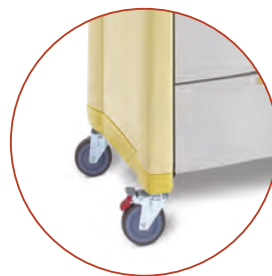
Spread Caster Position provides stability control by moving the wheels out toward the corners of the cart frame

The Avalo Isolation Cart provides innovative features that promote long-term, reliable function and value. Large-volume seamless drawer trays are supported by a unique guide system that ensures consistent performance year after year. Drawers open fully allowing easy access to contents in the rear of the drawer, and stay closed when the cart is in motion.