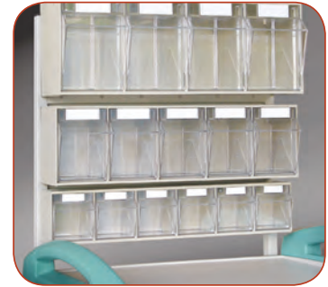
Tins Bins Organisers