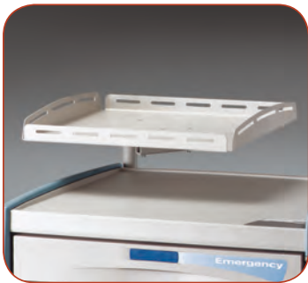
Defibrillator Tray & Mount