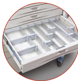
Drawer Flex Dividers