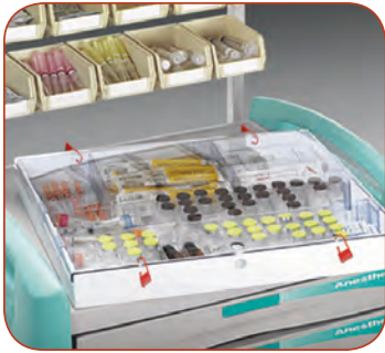
Divided Drawer Tray