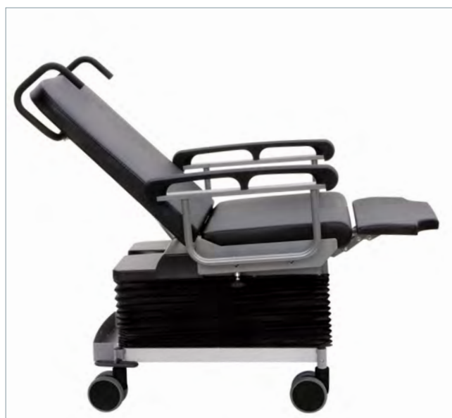
Electric patient positioning