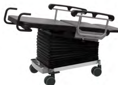
Trendelenburg and shock position