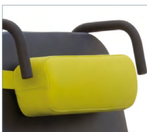
Head rest as standard