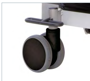
Central locking castors