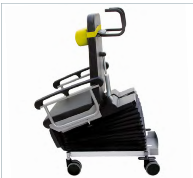
Electric sit-to-stand function

GREINER treatment couches are supplied with many inclusions as standard, however can be tailored to your precise needs. Premium covering materials and upholstery offer extra soft, wear resistant surfaces; a dynamically flexible suspension system within the seating surface supports freedom of movement for the spine, pelvis and hips, thus relieving pressure to the benefit of patients.