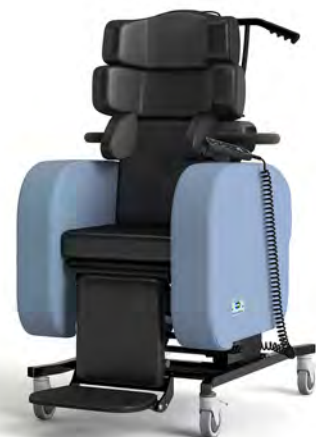
Paediatric Phoenix Chair