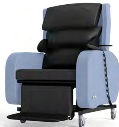
Bariatric Sorrento Chair